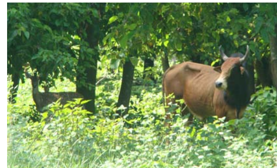
Hazards to ecosystems: Domesticated and wild animals grazing together due to human habitations close to forests

As an emerging, interdisciplinary field, it integrates veterinary, medical, ecologic and other sciences and investigates causes of emergence; analyses underlying drivers; and defines common rules in human, wildlife and plant and Emerging Infectious Diseases. The aim is to develop risk analysis to predict emergence of known and unknown pathogens. By looking at environment and health as a continuum, conservation medicine can effect rapid change in public opinion on complex societal issues. ■