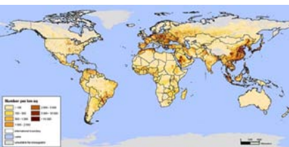
Global poultry distribution